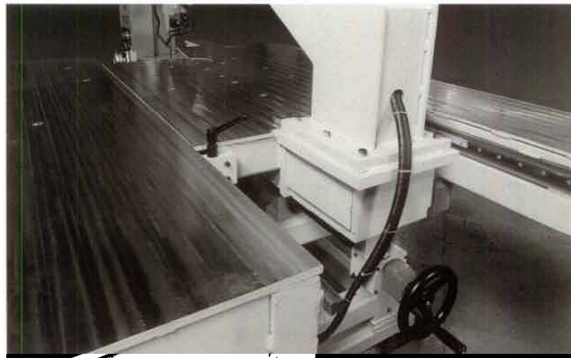
Table Adjustment for Circle Diameters