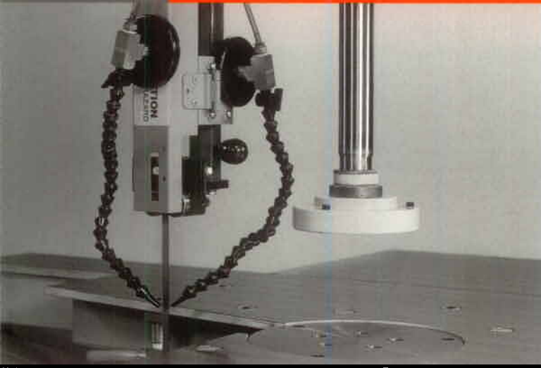
Hydraulic Turntable and Clamping Ram