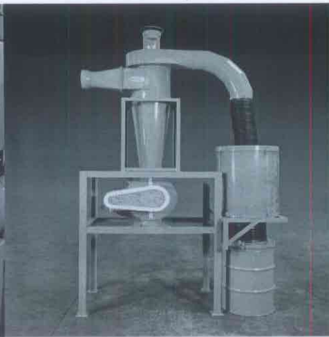
Chip Collection System