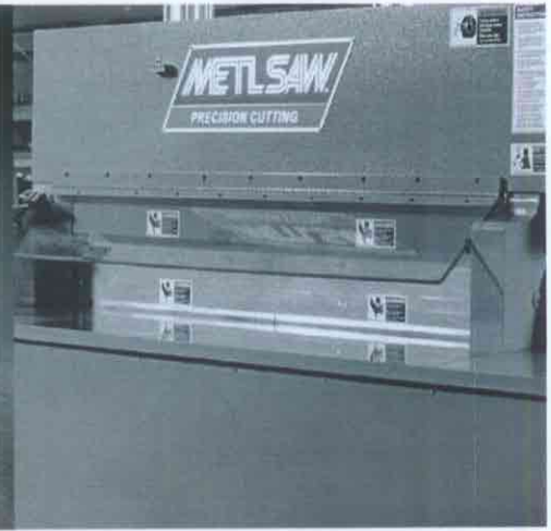
Solid Material Clamping