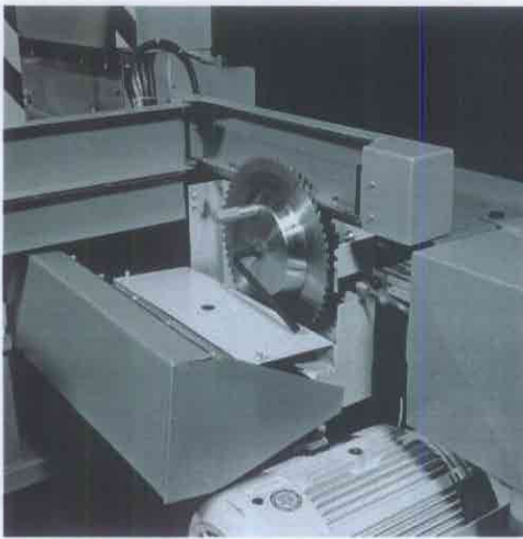
Easy Blade Change