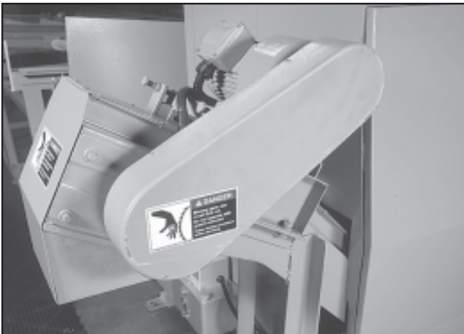
Chain Chip Collection Conveyor