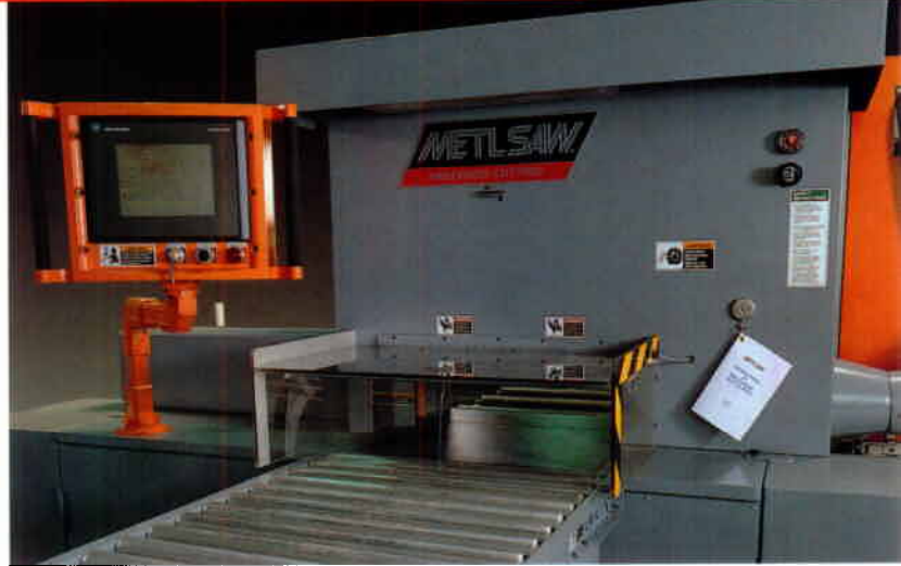
Protective Guarding with Electrical Interlock