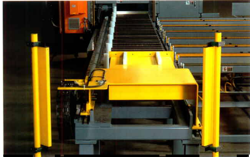
Precision Backgauge Positioning with Integrated Safety Light Curtain