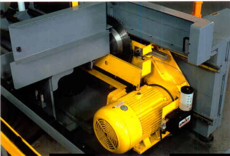
30 HP Arbor Carriage Motor with Easy Blade Change