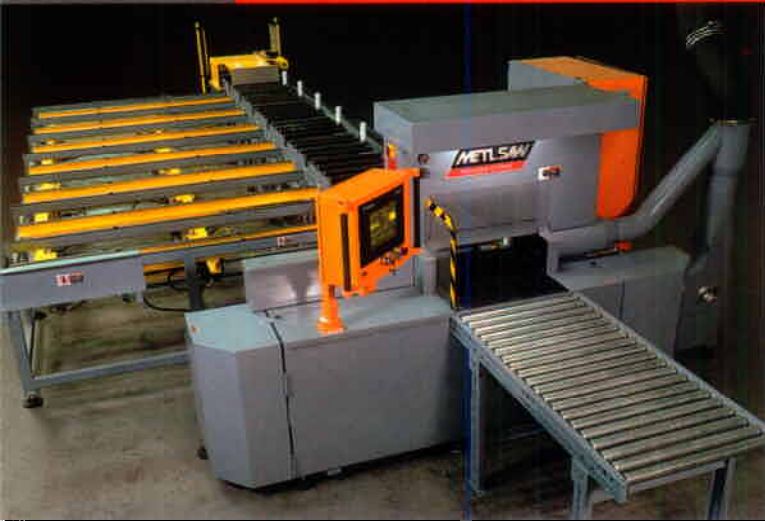
Three Stage Automatic Side Loader